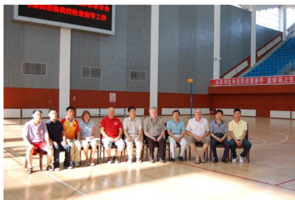
The inspection team at the University of Science and Technology Sports Hall in the company of OC members and CSSF officials