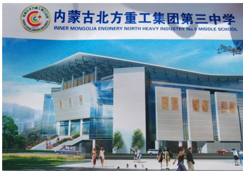
One of the sports halls under construction

It had to be noticed that most of the halls were still under construction but the OC guaranteed that they would be ready next June.