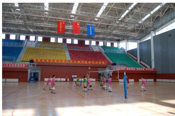
Training at the University of Science and Technology Sports Hall